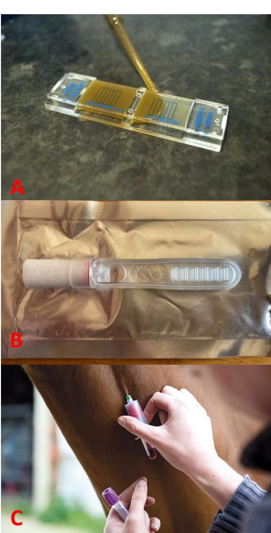
Figure 2: A) FEC slide (13) B) Saliva test C) blood test (14).